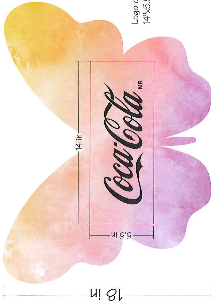
Logo or lettering area 14" x 5.5"